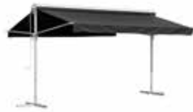
7775-8 Markis Awning parasol